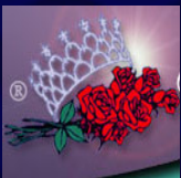
Mrs. Connecticut International 2007